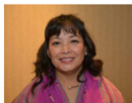
Joji Pantoja Coffee for Peace 2018